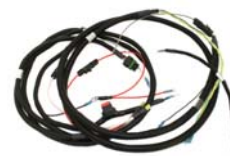
Wiring Harness Kit

** unless using alternator signal; contact factory for additional Mag Pick-up options