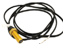
Magnetic Pick-up Sensor